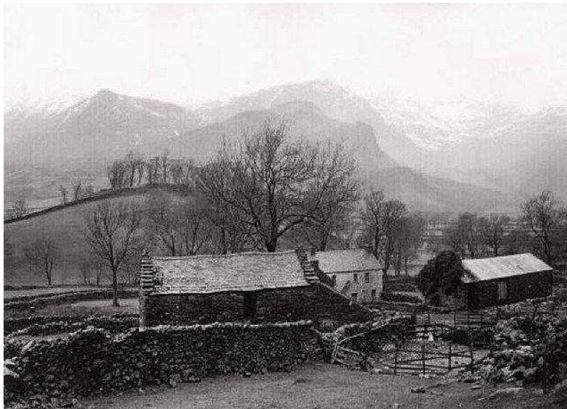
Goosemire Farm in winter