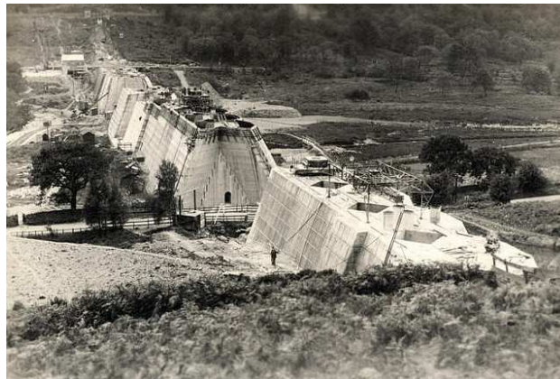
Construction of the Dam, Mardale

Hawes Water the natural lake of Mardale, was the highest of the English Lakes, being 694 feet above sea level, an important consideration when the water had to be taken to consumers eighty or ninety miles away. Work on the building of the dam started in 1930 but was suspended about a year later because of the national financial crisis. In 1934 work on the original scheme was restarted; it was estimated to cost £12 million.