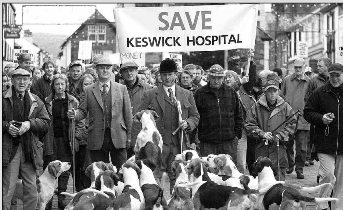
Boxing Day Meet, Keswick Market Square